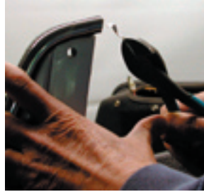
yank the staple,