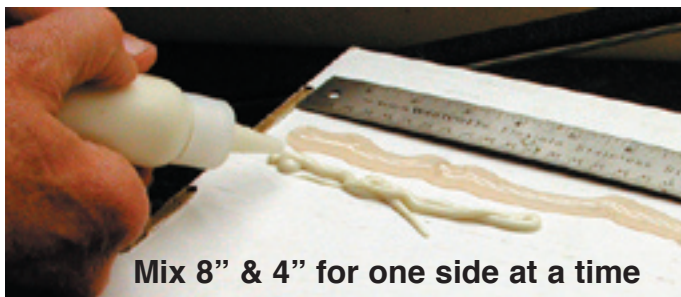
Mix 8" & 4" for one side at a time

Either go outside or use a fan to move air away from your nose. Hotcha Glue stinks for about 15 minutes