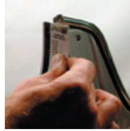
fill with Hotcha glue