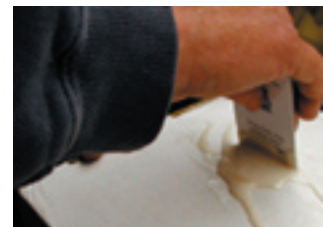
An old motel room key is great for mixing.

Use the box your kit was shipped in to mix the glue on.