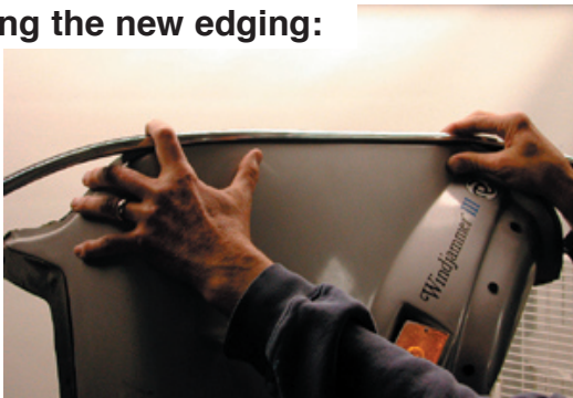
First, shape the edging without glue