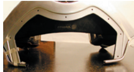
Masking tape holds edging in place

Use masking tape where needed to hold the edging in place. You have lots of time. Now do the other side.