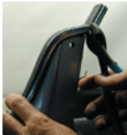
Cut off the ends,